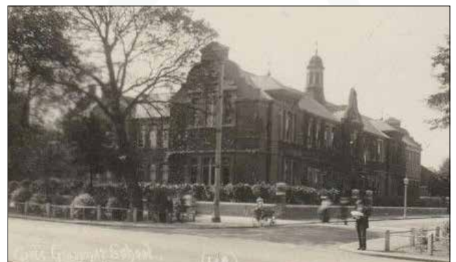
Prendergast Grammar School for Girls

"And as to all the residue of my estate and effects whatsoever consisting of pure personalty I give and bequeath the interest and income thereof unto my said wife and her said sisters for their joint lives and life of the survivors and survivor of them. And after the decease of such survivor, I give and bequeath the said residue to the Vicar and Churchwardens for the time being of the Parish of Lewisham for the endowment and support of a Grammar School for Girls in the Parish of Lewisham."