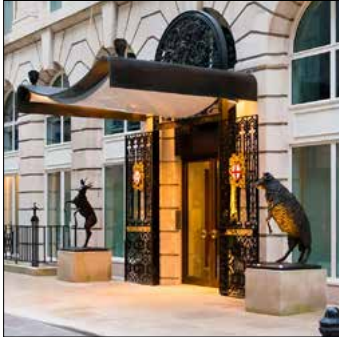
The Leathersellers' Livery Company