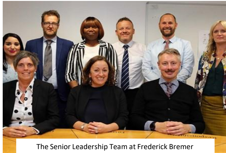
The Senior Leadership Team at Frederick Bremer

Frederick Bremer School is a creative and nurturing school where all staff and pupils are inspired to be 'the very best they can be'. We are judged as a good school across all areas and our SEN provision is outstanding. Our vision and values are central to our practice, and you will need to share our commitment to ensure every pupil is not only academically successful but is also equipped with the skills, qualities and attributes to be a successful 21st century citizen.